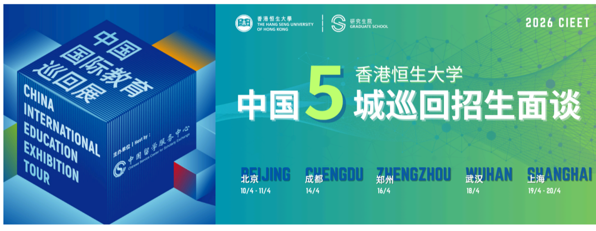
April 2026 | CIEET - Five-City Admissions Roadshow