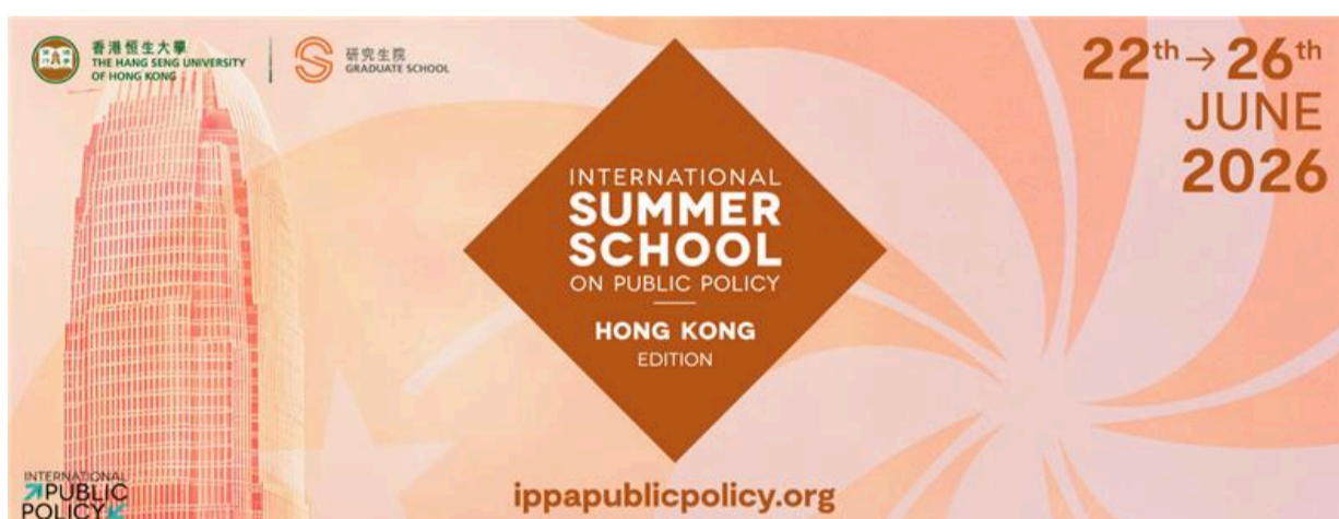
June 2026 | IPPA International Summer School on Public Policy - Hong Kong 1st Edition