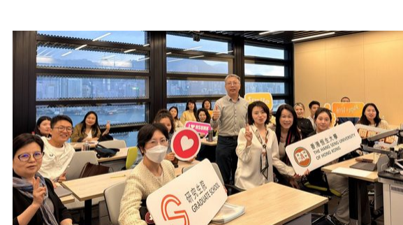
Student-led Cantonese course supports postgraduate students in integrating into Hong Kong | HIGH Programme