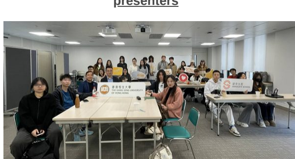
Graduate School hosts Postgraduate Students' Seminar Series 2025-26: The Evolution and Relevance of Liberal Arts Education | HIGH Programme