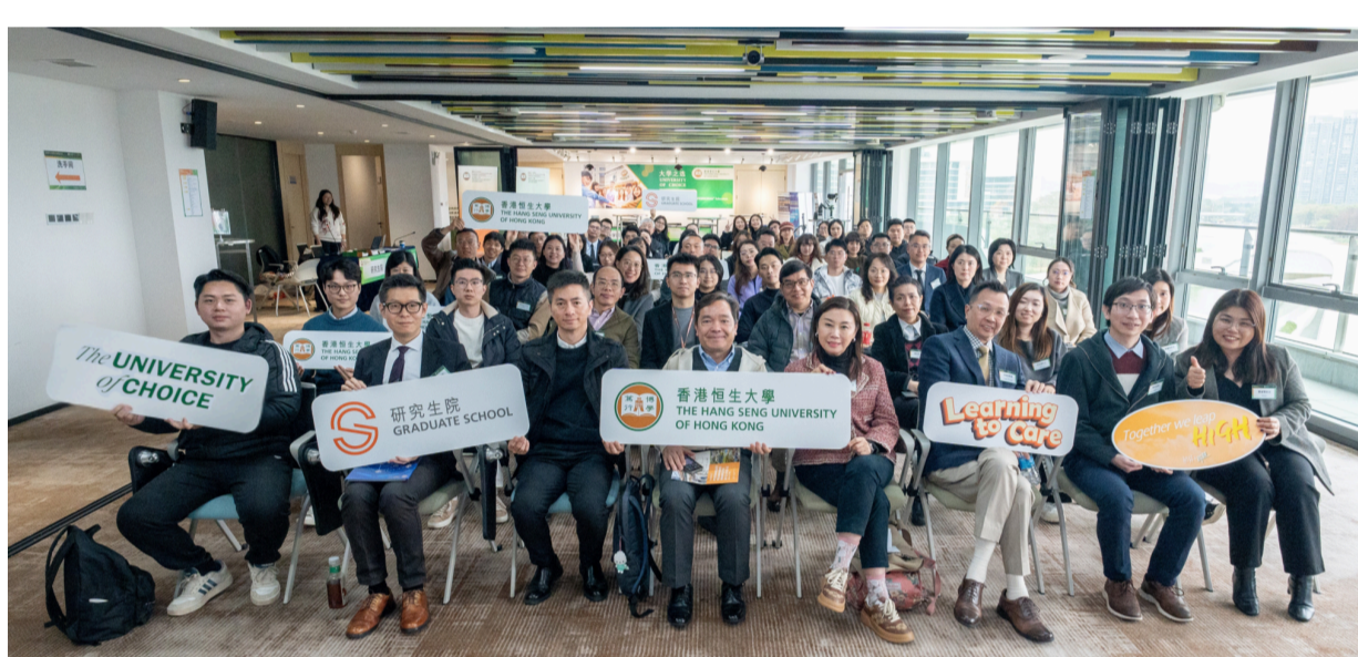
HSUHK Postgraduate Promotional Talk in Guangzhou maps out pathways for Chinese Mainland students and partner institutions