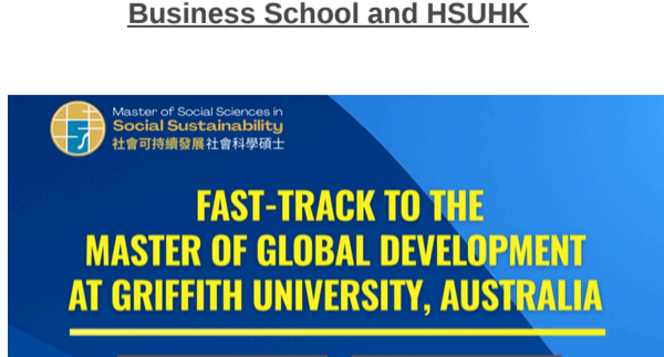
Master of Social Sciences in Social Sustainability, fast-track pathway to Master of Global Development at Griffith University, Australia