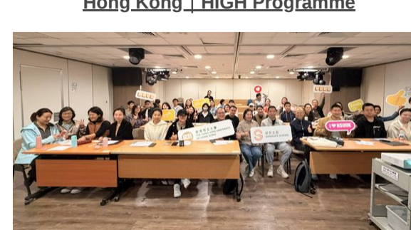
Workplace Cantonese Class launches at HSUHK, helping postgraduates find their voice in Hong Kong | HIGH Programme