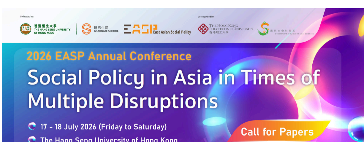
July 2026 | EASP Annual Conference - Social Policy in Asia in Times of Multiple Disruptions