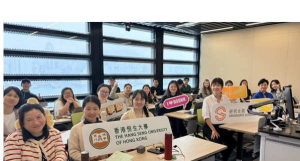
Speaking with impact: HIGH Programme workshops build confidence in postgraduate presenters