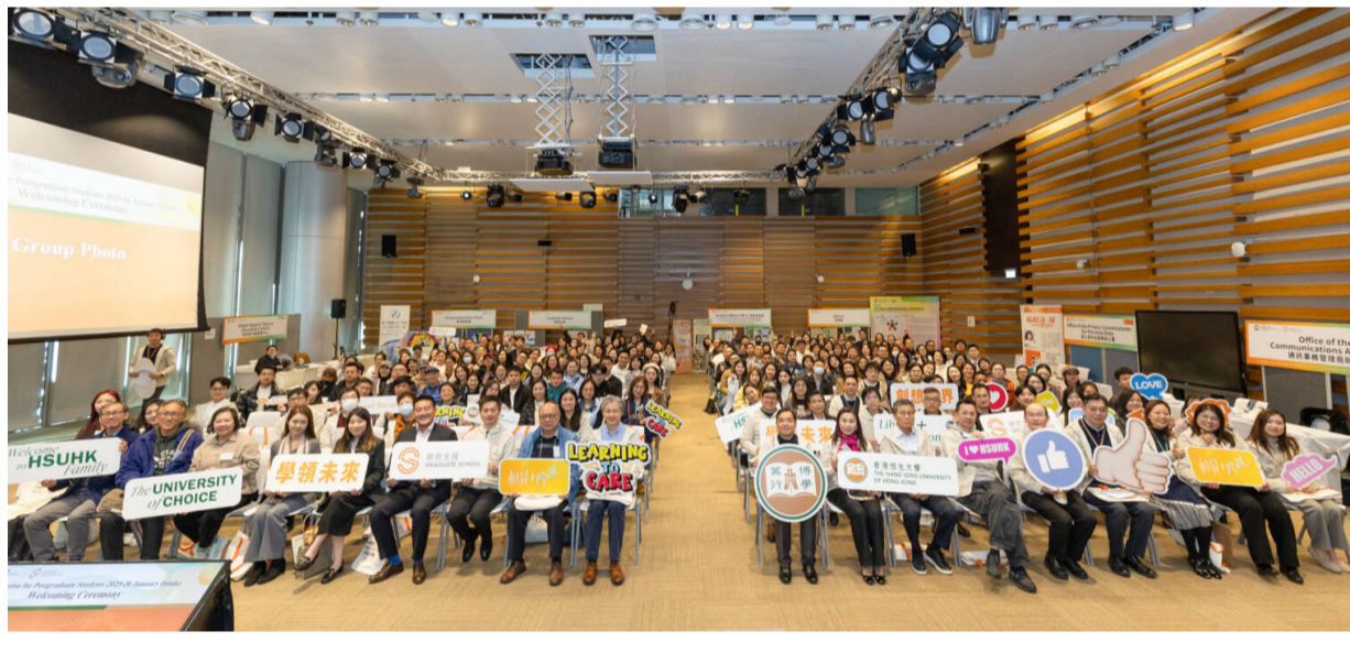
HSUHK hosts Orientation for Postgraduate Students (January 2025-26 Intake)