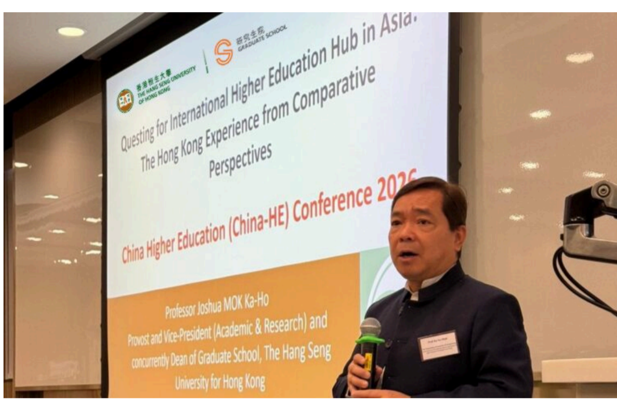
Advancing Hong Kong's vision as an International Higher Education Hub: HSUHK scholars at the 8th China Higher Education Conference 2026