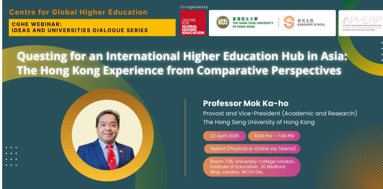
April 2026 | The Centre for Global Higher Education (CGHE) Webinar