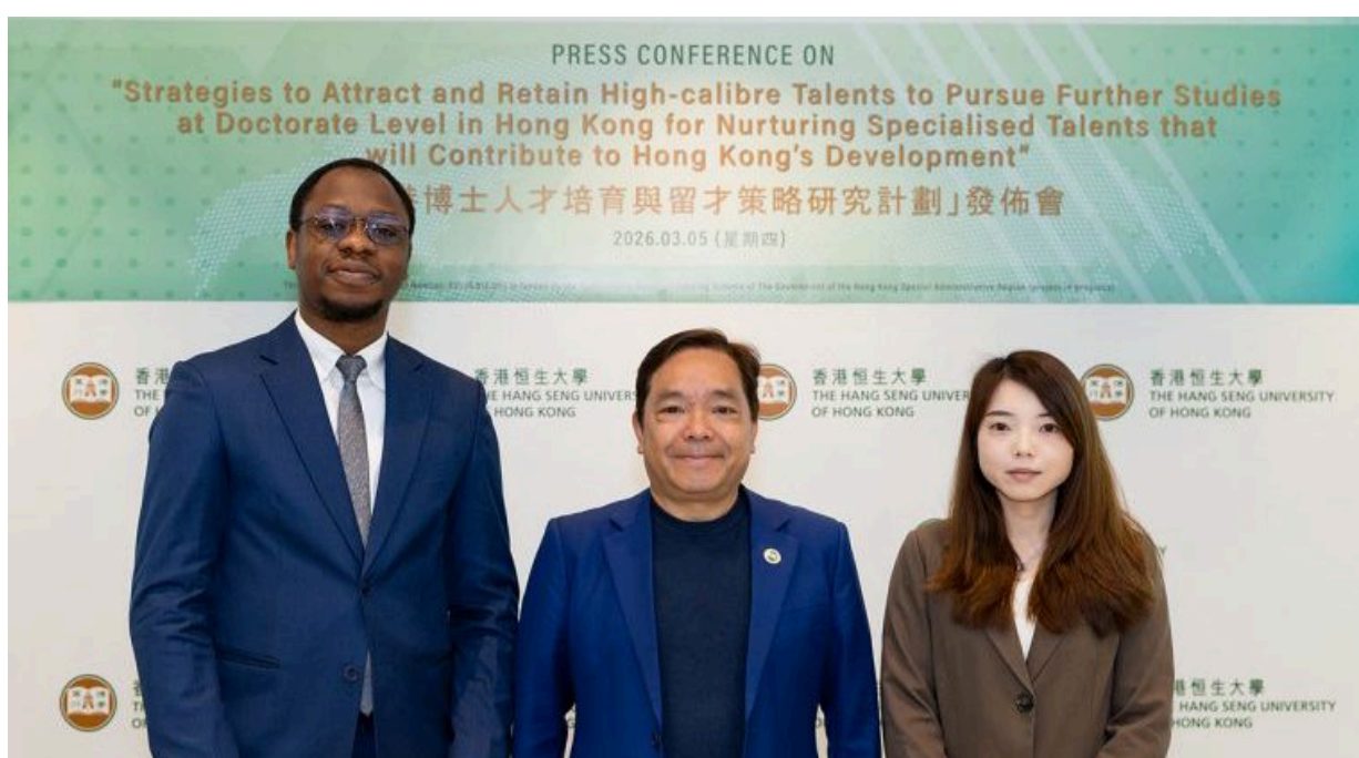
HSUHK study reveals Hong Kong's strong global competitiveness in doctoral education