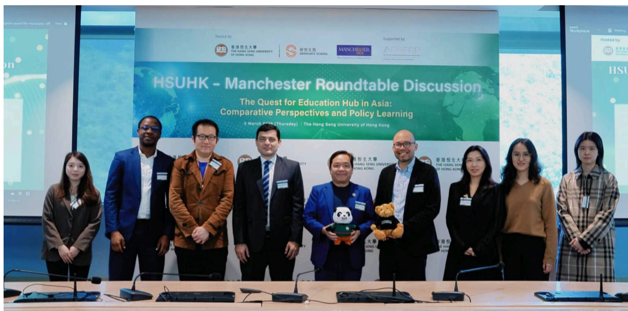
HSUHK Graduate School hosts HSUHK-Manchester roundtable exploring Asia as an Education Hub