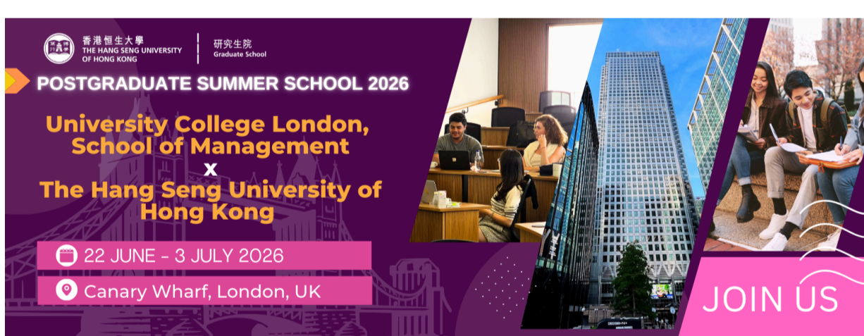
June 2026 | UCL School of Management X HSUHK: Postgraduate Summer School