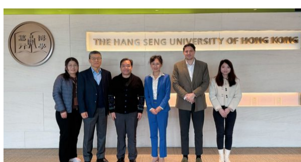
Exploring collaborative opportunities: a meeting of minds between Hult International Business School and HSUHK