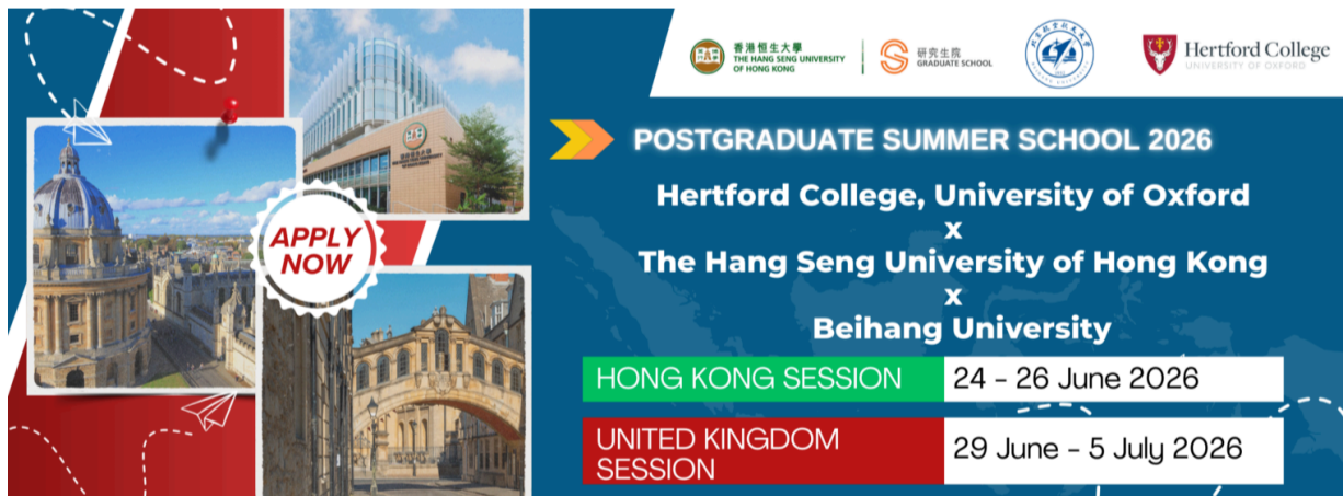
June 2026 | OXFORD x HSUHK x Beihang University : Postgraduate Summer School